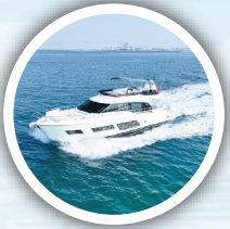
Private Yacht 67ft 1 Hour AED 9,000 Up to 15 Persons | Min 3 Hours