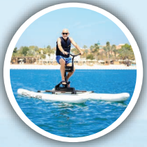
Schiller Bike 30 Min AED 250