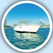
Fishing Trip 4 Hours AED 5,000 Up to 6 Persons