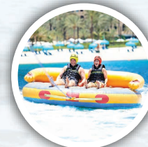
Donut Ride 15 Min / 2PX Min AED 200