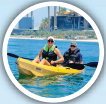
Double Kayak 30 Min AED 125