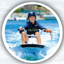
Electric Jet Ski AED 600 / 15 Min AED 1,200 / 30 Min