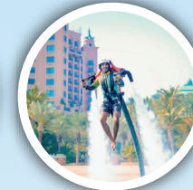
Jetpack AED 600 / 30 Min AED 1,000 / 45 Min pro