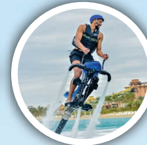
Jetovator AED 600 / 30 Min AED 1,000 / 45 Min pro