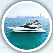
Private Yacht 78ft 1 Hour AED 9,000 Up to 20 Persons | Min 3 Hours