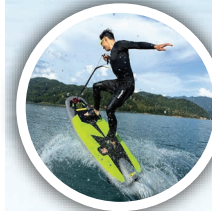
E-surf AED 1,200 / 30 Min AED 2,200 / 60 Min