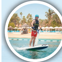
Flightscooter AED 1,200 / 30 Min AED 2,000 / 60 Min