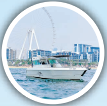
Mini Yacht 1 Hour AED 2,000 Up to 6 Persons