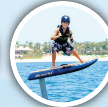
Jet Board - Foil AED 1,200 / 30 Min AED 2,000 / 60 Min