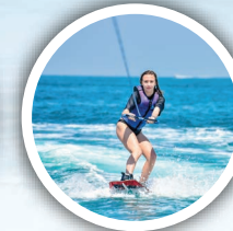
Wakeboard / Skiing 30 Min AED 800