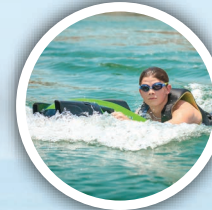
iAqua AED 550 / 15 Min AED 1,100 / 30 Min