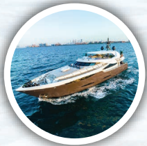
Private Yacht 110ft 1 Hour AED 18,000 Up to 25 Persons | Min 4 Hours