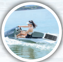
eWave Single AED 1,200 / 30 Min AED 2,200 / 60 Min