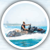
Jetski Tour Single AED 750 / 30 Min AED 1,100 / 60 Min