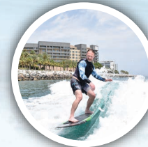
Wakesurf 60 Min AED 2,500