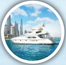
Private Yacht 50ft 1 Hour AED 3,000 Up to 10 Persons | Min 3 Hours