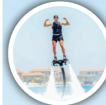
Flyboard AED 600 / 30 Min AED 1,000 / 45 Min pro