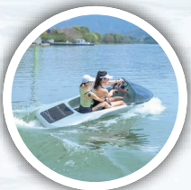
eWave Double AED 1,400 / 30 Min AED 2,400 / 60 Min