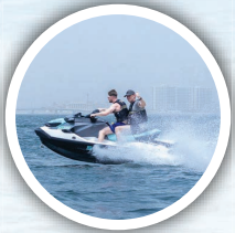
Jetski Tour Double AED 950 / 30 Min AED 1,500 / 60 Min