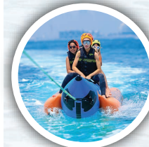
Banana Boat 15 Min / 2PX Min AED 200