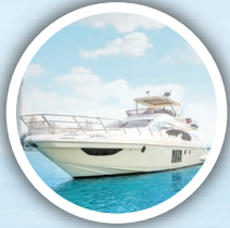
Private Yacht 64ft 1 Hour AED 4,500 Up to 12 Persons | Min 3 Hours