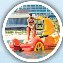
Pedal Boat 30 Min AED 300