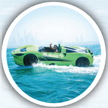
Jetcar AED 3,000 / 30 Min AED 5,000 / 60 Min