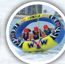
WOW Ride 15 Min / 2PX Min AED 200