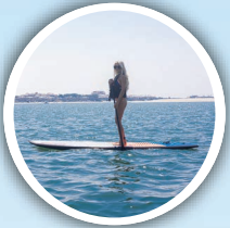
SUP 30 Min AED 100