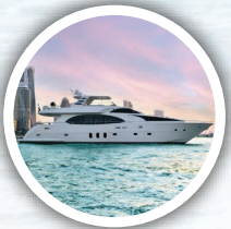
Private Yacht 90ft 1 Hour AED 9,000 Up to 20 Persons | Min 3 Hours