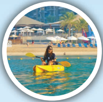
Single Kayak 30 Min AED 100